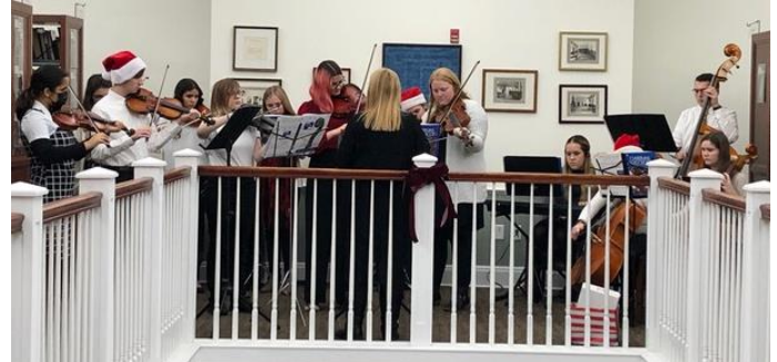
CRCS Orchestra Christmas concert this past December.

Since The Community Library is going through extensive costly renovations, our organization needs to step up to meet these future demands. More fundraising is needed so that the library can meet future demands. Therefore, our goal is to increase our membership. Please consider joining The Friends.