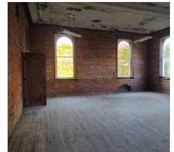
Multipurpose Room on the second floor. Hazardous materials removed.

While a significant amount of money has been obtained, costs have increased and we are unsure that it will get us to full restoration of the Annex but the Library will continue to seek grants to achieve the full restoration.